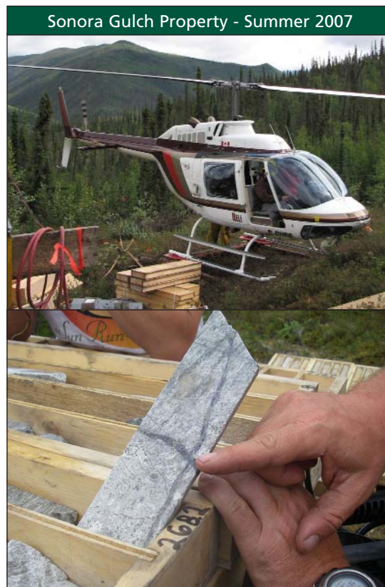
Helicopter landing at Sonora property drill site.

Drilling in 2006 returned an intercept from the Amadeus Zone of 6.21 g/t gold across 15.2 metres, including 12.9 g/t gold across 5.0 metres. Follow-up drilling in 2007 intercepted 5.22 g/t gold across 4.0 metres within a larger, lower-grade halo of 1.0 g/t gold over 64 metres. In addition several silver-rich intervals in the Amadeus Zone were intersected, including 0.25 g/t gold and 162 g/t silver of 2.0 metres and 1.12 g/t gold and 817 g/t silver across 2.0 metres. A new gold target, the "Ultramafic Horizon" was also identified in altered volcanic rocks, several kilometres west of the Amadeus Zone.